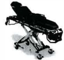
Power-PRO XT- Discontinued- 2025 NIESA- 5