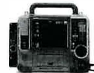
LIFEPAK 15- Discontinued- TBD NIESA- 4